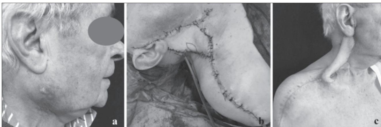
Fig. 3. Cervical skin reconstruction: preoperative appearance of a SCC lymph node metastasis involving cervical skin (a) and after tumour removal and SCAIF reconstruction (b), demonstrating optimal colour and texture of the flap (c).

Nonetheless, accurate preoperative assessment of flap feasibility is advisable. SCAIF is pedicled on the supraclavicular artery, a branch of the transverse cervical artery. The pencil Doppler probe is a very useful tool to locate the artery both preoperatively and intraoperatively 9 10 . However, in our experience it can sometimes be hard to draw the course of the artery preoperatively. If there is any doubt about the presence and location of the supraclavicular artery, angio-CT 16 can be a valuable resource to aid in safe flap harvesting. This is especially true for patients who already underwent previous surgeries on the neck, as the transverse cervical artery is encountered during dissection of the lower portion of Robbins level IV 17 , where it can be damaged.