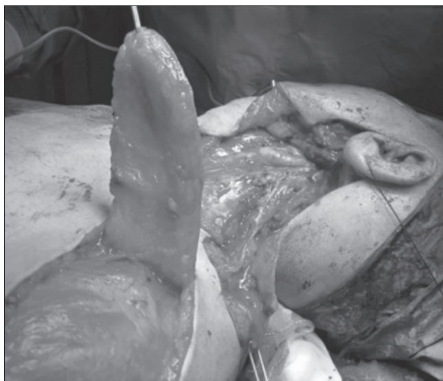
Fig. 1. SCAIF harvesting. The flap will be tunneled and used for cervical skin reconstruction, with a 180° arc of rotation.

and the flap was tunneled under the cervical skin. For facial and cervical skin reconstruction, the flap can be tunneled or simply rotated to cover the defect (these latter cases are marked with an “*” in Table I). After simple rotation of the flap, the pedicle can be cut after at least 3 weeks to gain better aesthetic and functional outcomes.